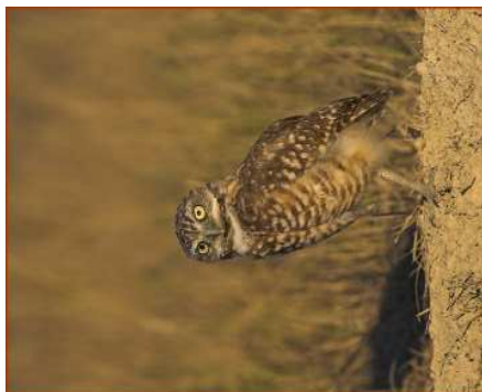
Burrowing Owl

Shuttle service is available from Kadoka and Murdo to Rasmussen-Lehman 33 Ranch for this event. Please indicate your interest in the shuttle on the registration form.