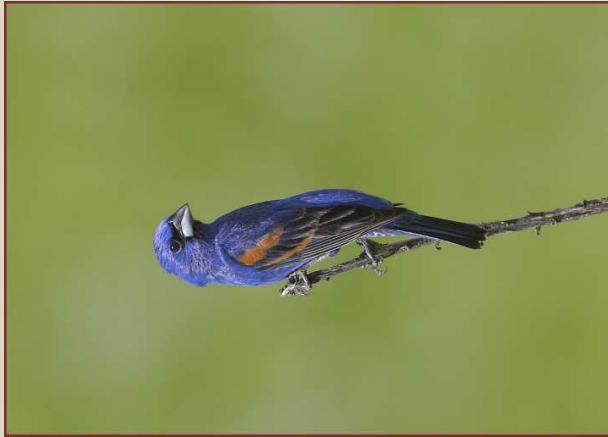
Blue Grosbeak

June 5 - 6, 2009 Rasmussen-Lehman 33 Ranch Belvidere, SD