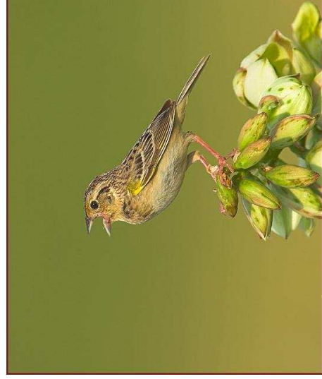
Grasshopper Sparrow

Cancellation Policy: No refunds after June 1, 2009.