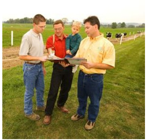
Conservation planning meeting in the field.

This boundary between work and life is important. Without it, what we do becomes who we are. If what we do is who we are, who are we when we stop doing? How do we make the transition to the next generation? It often happens over Dad's dead body, literally. Without the line between work and life, how do we hold family members accountable in the business without having a food fight in the dining room? (Or is it the boardroom?)