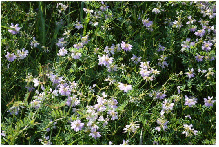
Crown vetch.

Crown vetch produces a very dense canopy cover, is rhizomatous, and has a multi-branched root system.