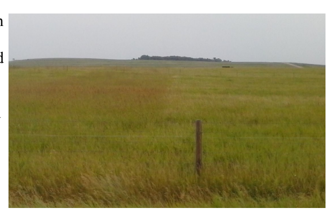
Pasture that was grazed the previous year (on the left) and ungrazed (on the right). Notice the reddish color of the seed heads and darker green of the grass compared with the lack of seed heads and lighter color of grasses from the ungrazed area on the right.

I conducted a small experiment in eastern South Dakota where I compared two areas (side-byside) that had been grazed the previous year and an ungrazed control. The total aboveground biomass in the grazed area one year later was 5900 lbs/acre and 6100 lbs/acre in the ungrazed control. Interestingly, was the difference in litter and current year's production between the two plots. The grazed area had a total of 3400 lbs/acre of live biomass and 2500 lbs/acre of litter. The ungrazed area had 1900 lbs/acre of live biomass and 4200 lbs/acre of litter. To the right is a photo of the grazed and ungrazed areas. This is a good example of excess liter limiting both the energy flow and nutrient cycle.