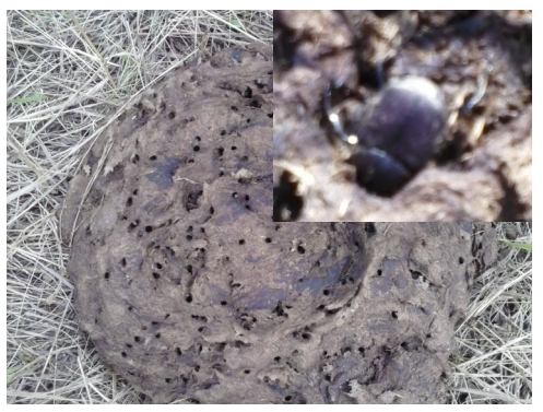
Roller type dung beetle (upper right corner) and holes from other burying type dung beetles.

(modified after Pyke et al. 2002; Pellant et al. 2005; Orchard 2013).