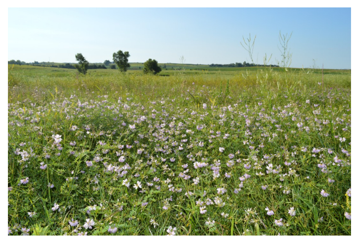
Crown vetch overtaking a native pasture in western South Dakota (Photo: L. Perkins, 2015).

This growth habit offers good soil holding ability and allows crown vetch to be very successful during drought-like conditions. However, these same traits enable it to invade our grasslands, decrease our range-land health, impact our native species diversity, and potentially degrade wildlife habitat. Crown vetch rhi-zomes have reportedly been found that are over 9 feet long and a single plant has been reported to spread over 80 square feet within a just a few years. Crown vetch outcompetes native and non-native plants and has the ability to rapidly spread in rangeland areas.