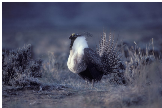
Greater sage grouse (Photo by Ron Nichols, NRCS Photo Gallery).

Proper grazing use of 35% is typically recommended for these native grasses compared with the 50%, take-half, leave-half in the midwest. Shrubs like big sagebrush thrive here and support sage grouse, an iconic upland game bird of this region. Ranchers tend to use mountain pastures in the summer and graze closer to home in the fall, winter, and spring.