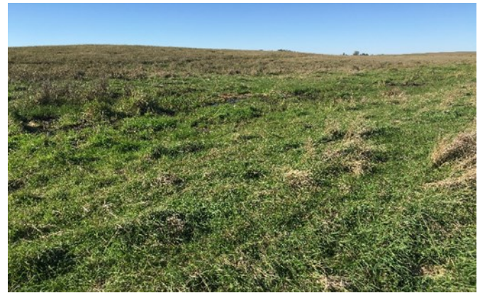
A swath of smooth brome in a Volga grassland. Brookings County has experienced rates of atmospheric N deposition up to 20 kg per hectare per year.

We believe they can. In a greenhouse experiment we determined H in two native (western wheatgrass, Canada wildrye) and two invasive grasses (smooth brome, crested wheatgrass) by cultivating them across a range of known soil nutrient concentrations and examining leaf nutrients. We found that the invasive grasses had a lower value of H than the native grasses. We suspect that this trend holds for many invasive and native grasses. What does this mean for our grasslands? Agricultural runoff, atmospheric deposition, and soil management practices can all lead to increased levels of N in soils, creating conditions that promote the success of invaders. The challenge to conserve our native vegetation, the value it provides, and the effort to prevent the spread of invasive grasses is then, in part, the challenge to maintain the chemical integrity of our prairie soils.