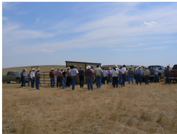
2007 Annual Bus Tour at Bill Slovek's ranch where participants braved the excessive heat to learn about Bill's pasture AI system (Photo by Sandy Smart 2007).

The Coalition has hosted the annual bus tour, holistic resource management workshops, pasture walks, annual bird tour, and annual winter road show among others. One of the most memorable times for me was the 2007 annual Bus Tour at Bill Slovek's ranch. That was the first time I heard Gabe Brown speak on soil health and other topics before he became famous. That July day was especially memorable because I remember riding in Bill's pickup with the temperature hitting 117 °F. We learned about Bill's impressive rotation that combines flash grazing and the possibility to graze each pasture in the winter.