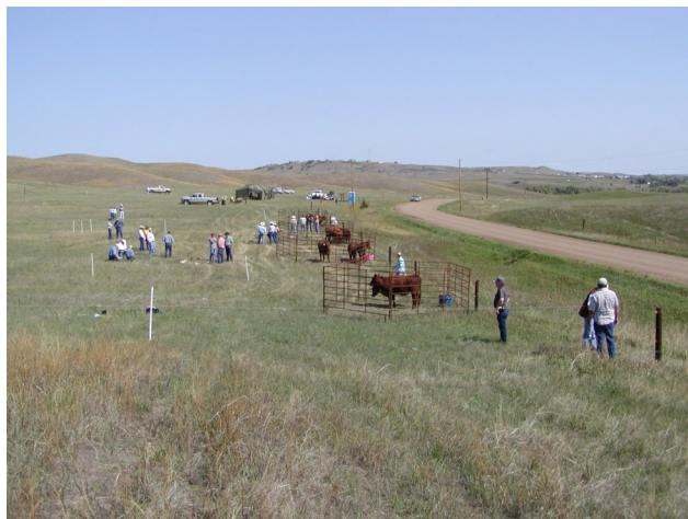
Students have to determine the appropriate size paddock for a 1-day grazing period using real animals (2006 SD Grazing School).

This year the South Dakota Grassland Coalition is celebrating its 20th year. As part of this special anniversary we are highlighting the work of our various committees. This issue we spotlight the work of the Education Committee. This is the bread and butter of the Coalition. The annual SD Grazing School is our most noted program. The School first started in 2003 and features presenters from SDSU, NRCS, and ranchers. Over the years, the hands-on nature and the rancher-delivered messages have turned this annual school into the Coalition's signature program. The school has become so popular that we offer two schools back to back in the second week of September.