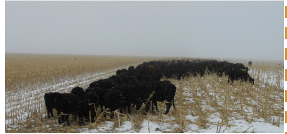
Strip grazing standing corn in winter near Selby, SD (Photo by D. Sieck).

At 56 pounds per bushel, 10 pounds of corn/cow costs about 54 cents. Sieck supplements with alfalfa twice a week, about 15 pounds per cow per feeding or 30 pounds per week. The hay charge is about $1.50 per week or 21 cents per day. His total feed cost per cow is approximately 75 cents/day.